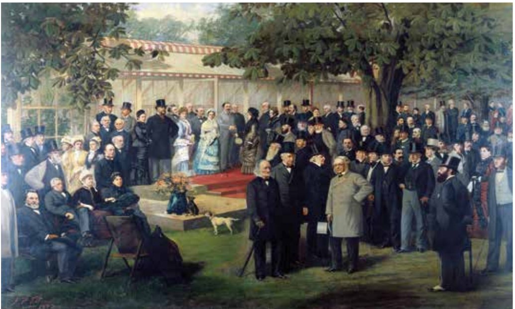
A garden party given for members of the 1881 International Medical Congress in the gardens of Holly Lodge, the home of Baroness Burdett-Coutts

That way her money was not wasted on madcap schemes.