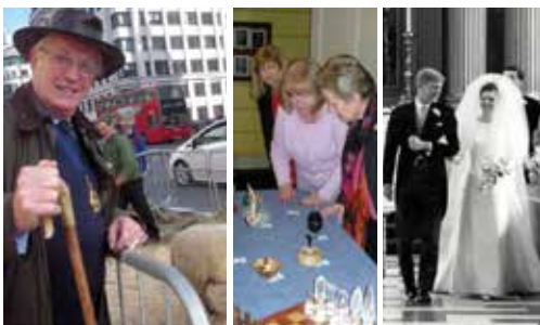
Sheep Drive across London Bridge; tour and turning display at the Reform Club; our wedding at St Bride's

The Patronal Service at St Bride's was particularly evocative for the Bridgeman household as this is where the Mistress and Master were married.