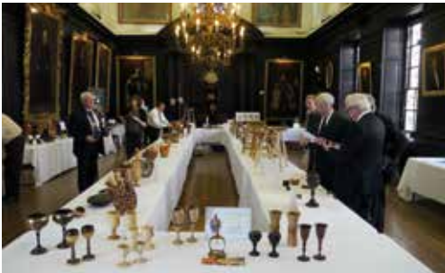
Competition judging in Apothecaries' Hall

The 2014 Competitions of the Turners' Company were held in Apothecaries' Hall. For the first time they were open to the public – a one day 'pop-up' exhibition which attracted over 500 visitors. The Competitions are held biennially. All entries to the 2016 Competitions will be included in the Wizardry in Wood 2016 exhibition at Carpenters' Hall.