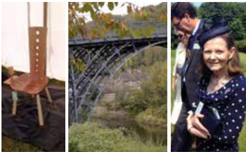
This delightful chair was an award winner; the iron bridge at Ironbridge; the Mistress Turner

My first formal engagement was the Bodgers Ball – a must for anyone interested in woodcraft. The Mistress Turner and I marvelled at the best of woodcraft from shave-horse to pole-lathe.