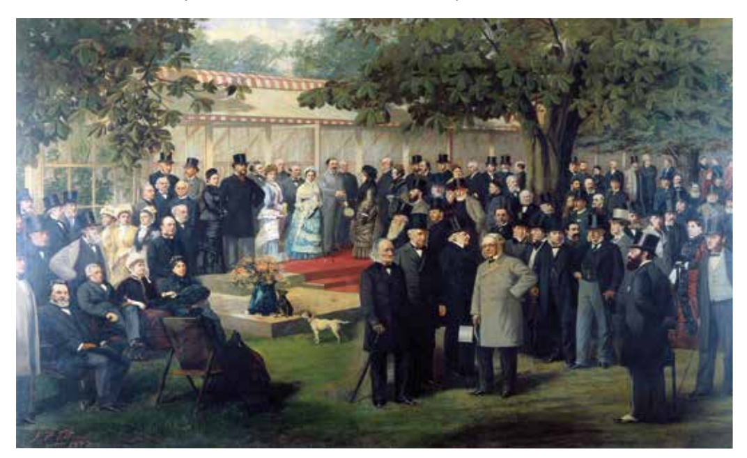
A garden party given for members of the 1881 International Medical Congress in the gardens of Holly Lodge, the home of Baroness Burdett-Coutts

That way her money was not wasted on madcap schemes.