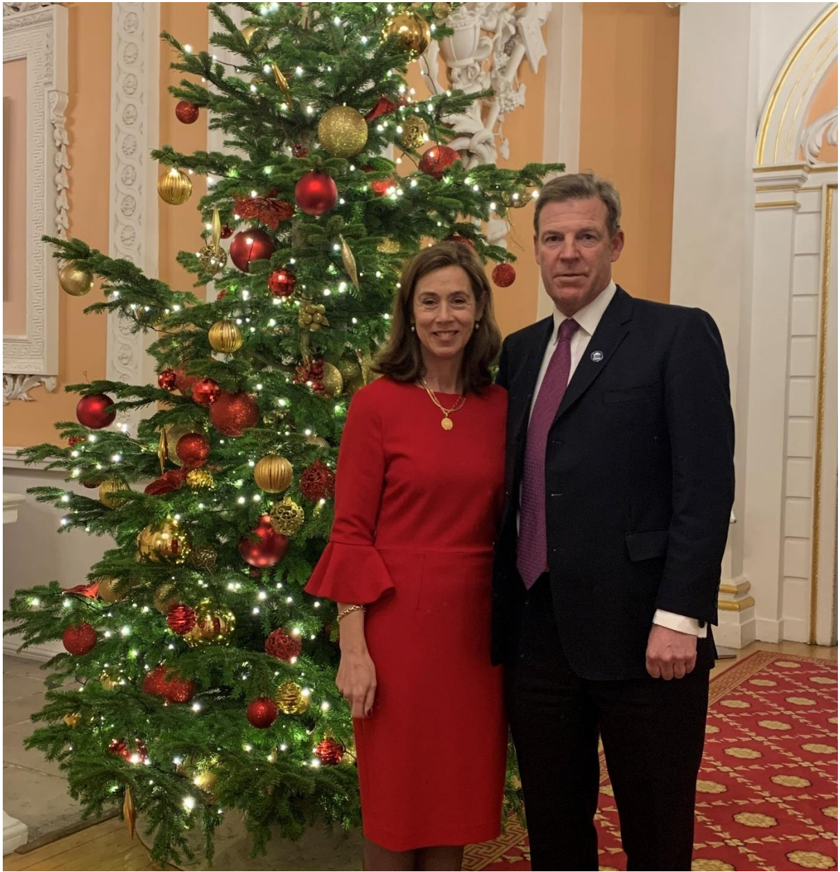
Merry Christmas from the Lord Mayor and Lady Mayoress