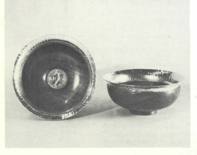
A pair of mazers made of walnut with sterling silver Bands and Targets, and inscription.