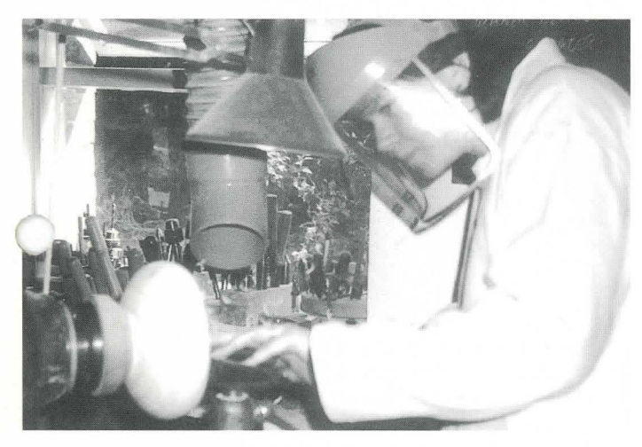
A student turning a bowl on the second day of her course

Oh yes, since 1980. Some of my students are carpenters and joiners who want to add to their skills, some are young men going into furniture restoration - from such places as the furniture school at Thame in Oxfordshire which doesn't, oddly enough, teach turning. The others are chaps (and 12% ladies, who are very good at being taught) looking for a retirement hobby.