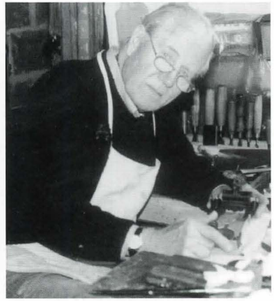
The Beadle in his workshop; and one of the red leather cases with cunningly fitted interior which he made for the Howe Collection