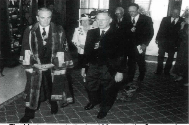
The Master escorts the Lord Mayor to the Company's Millennium Turning Competitions in Apothecaries' Hall

In July we held the Millennium Turning Competitions. Our thanks for this goes to the Howe Committee, the Professional Turners, the Ornamental Turners and the Association of Woodturners of Great Britain for all their hard work in setting it up and running it on the day. The Guild role of the Livery, namely the support of the craft, is one of the most important of our activities.