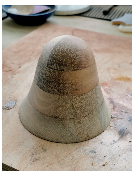
Bell shape comprising four layers of multiple Iroko straps

An alternative plan was rapidly developed for a new bell to be made by Liverymen Gabor Lacko and Patricia Spero using the wooden straps of Iroko wood that had been attached to each headstock.