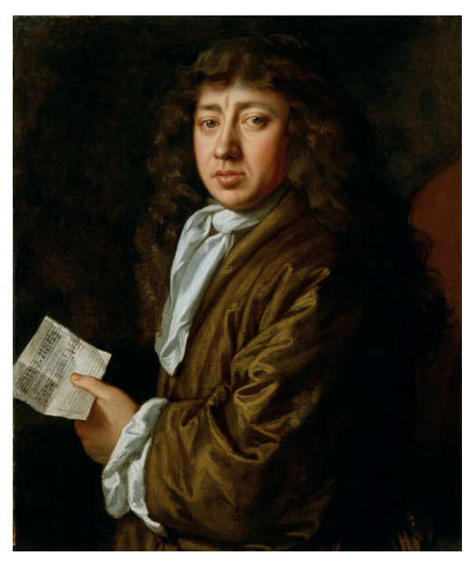
Samuel Pepys in 1666 by John Hayls National Portrait Gallery, London

The Turners' Consort allows for authenticity in the playing of Medieval music. But modern day players do not have access to instruments of the style used in the 17th century to play music, for example, by Purcell (1659-1695). The current choice is to use a recorder design from the 16th or the 18th century, for example by Stanesby.