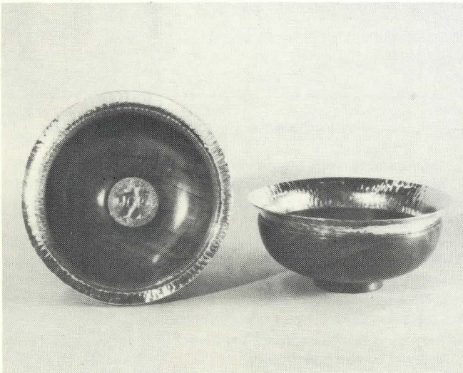
A pair of mazers made of walnut with sterling silver Bands and Targets, and inscription.