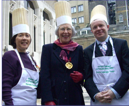
Space for Caption

Picking out highlights is almost impossible but there are some moments which are fixed in my mind's eye: the Parish Clerks' Company dinner, when members toast one another using not their own name, but the name of the saint of their church, so that a middle-aged, respectable-looking man rises, glass in hand, and calls to a similar man "Saint Mildred toasts Saint Anne!". The blazing June heat in which robed Livery Masters paraded around the ring of the Royal Cornwall Show, after the sheep and before the horses. The poignant silence as Masters planted their crosses and poppies outside St Paul's in remembrance.