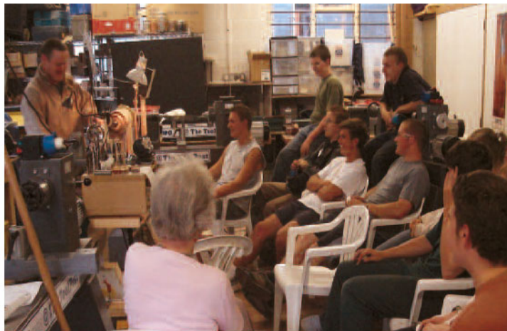
Teenagers on a turning weekend run by the Association of Woodturners of Great Britain with support from the Company

Members of the Group raise the profile of their crafts at exhibitions and arrange outside activities and visits to places of common interest.