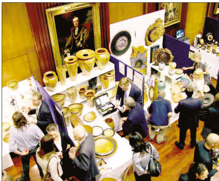
View of Wizardry in Wood 2008 held in the magnificent Carpenters' Hall, home of the Worshipful Company of Carpenters