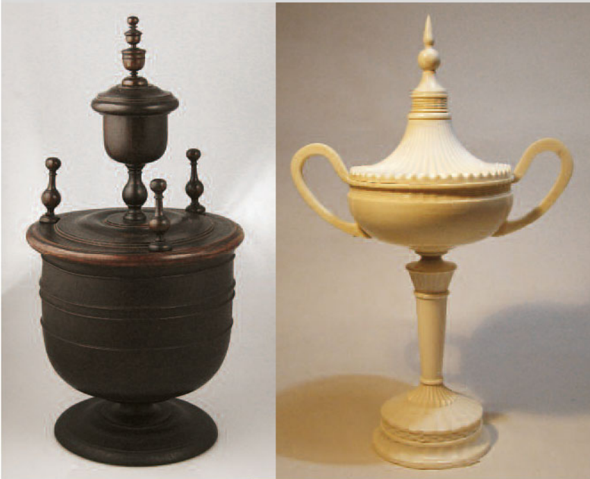
Above left: Magnificent wassail bowl dated 1685 from Sampson & Horne Antiques