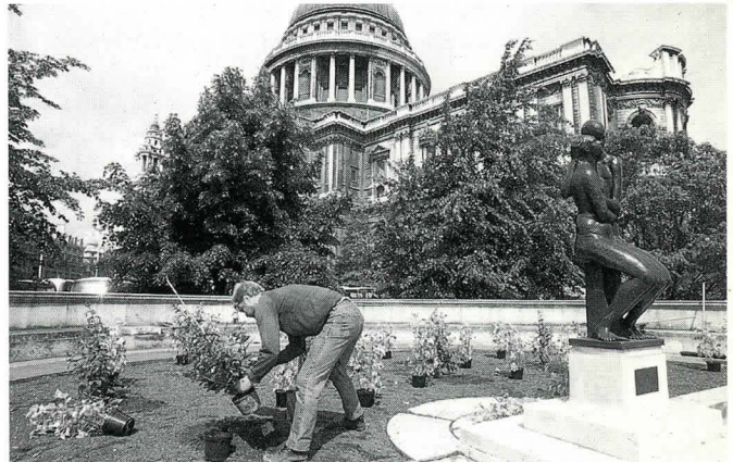
Keeping the City blooming: the Parks & Gardens Department uses only six out of a possible 506 possible chemicals.

Whatever you want to know about the City you will find out on the ten-evening City Managers' Course. Visit the nerve centre of the City Police, see the barges which take away the City's waste, be entertained by students from the Guildhall School, have your every question answered, make friends, enjoy food and drink into the bargain. More details of this marvellous experience from the PR Department of Guildhall.